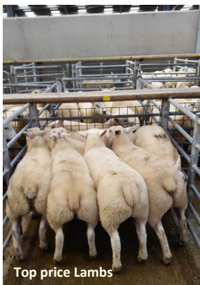
Top price Lambs